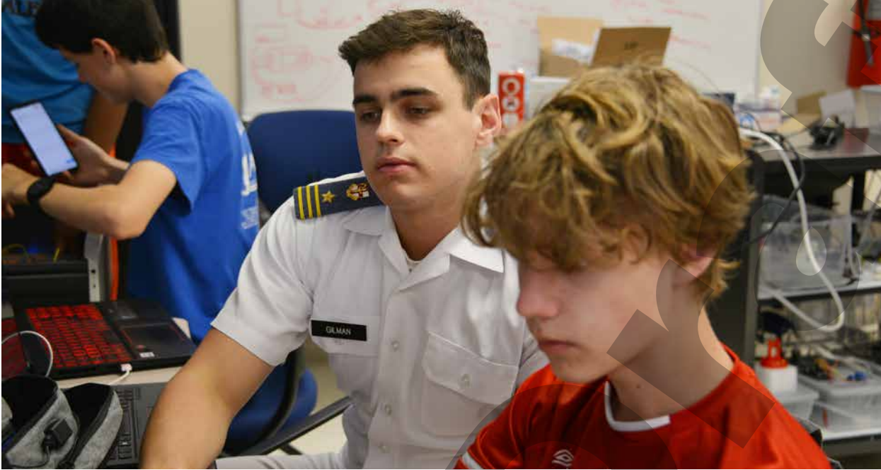
Virginia Military Institute, in collaboration with Virginia Tech, held a 12-week internship for high school students, funded by a workforce development grant from the Commonwealth Cyber Initiative. The grant seeks to build a pipeline of mentorship in which graduate students from Virginia Tech, (with more knowledge and experience on cyber security topics) mentor VMI cadets, and in turn the cadets mentor local high school students. The goal of the internship is to teach the high school students how to develop practical hardware, software, and cybersecurity skills through in-person practical learning and self-paced online training.